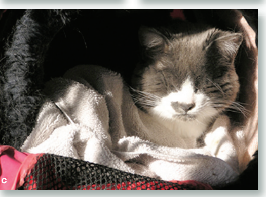
FIG 3 Environmental needs change with life stage, although environmental enrichment and adequate resource allocation remain important for all cats. While play and play items are a priority for the kitten and junior (a and b), easy access to a soft bed (c) and a comfortable resting spot, such as a sofa (d), assumes more importance in the senior and geriatric cat. Pictures (a), (b) and (d) courtesy of Deb Givin; (c) courtesy of Ilona Rodan