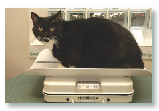
FIG 2 Regular assessment of weight and body condition score is important in cats of all ages – and this needs to be stressed to owners. Expressing any changes in weight as a percentage, or in terms of an equivalent weight loss/gain in humans, can be helpful.

Cat owners are willing to seek more veterinary care when it improves quality of life and detects illnesses earlier, thereby reducing the long term expenses associated with their cat's health care.